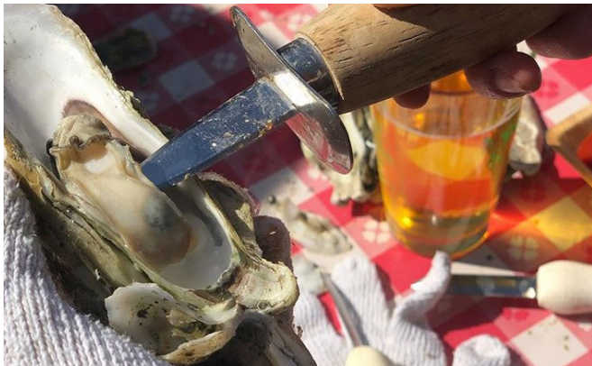
Shucking away at the Oyster Roast

Learn more at www.gaconservancy.org/oysterroast