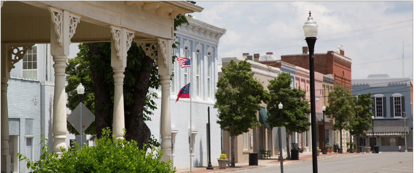
Downtown Sandersville, Ga